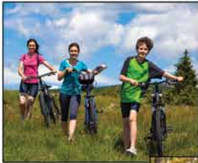
Hiking, Biking Fishing Picnic Area