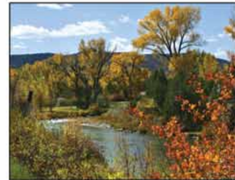
Views for all seasons