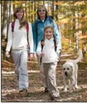
Take the RiverWalk to town - Concerts, galleries, theatre