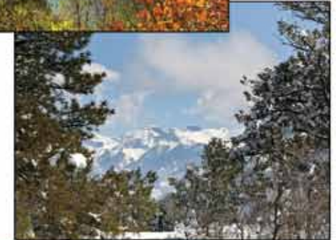
Views from every window and every trail