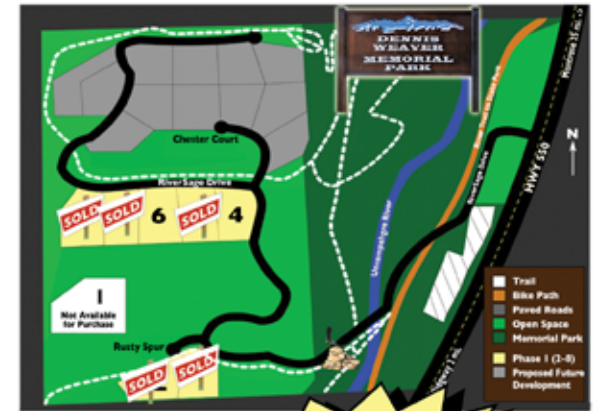
not to scale