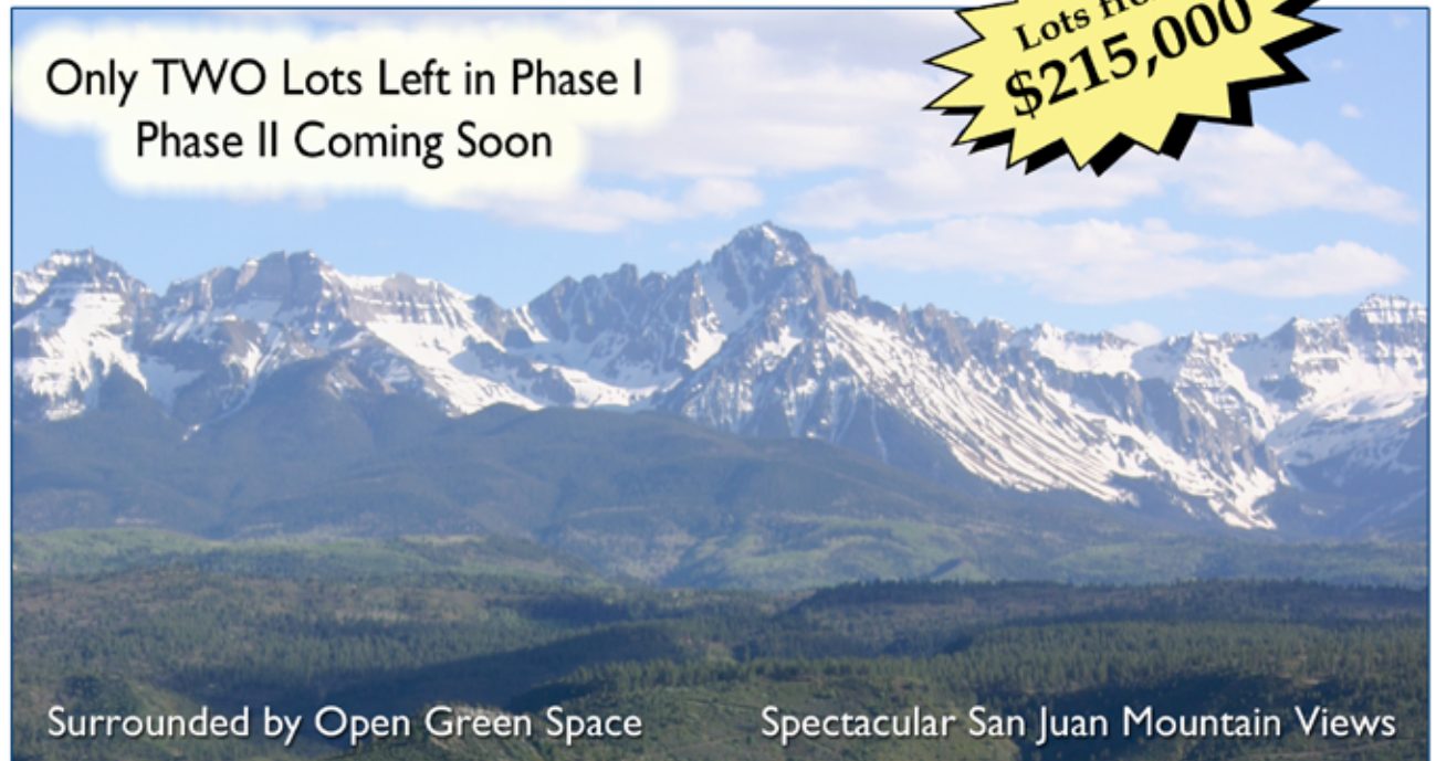
Surrounded by Open Green Space

Only TWO Lots Left in Phase I Phase II Coming Soon