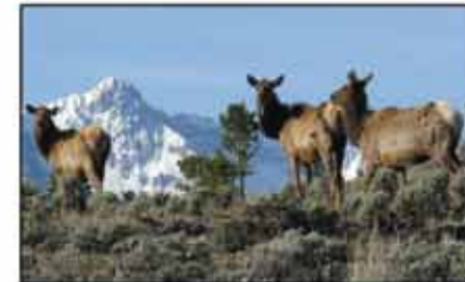
Birds Wildlife Waterfowl